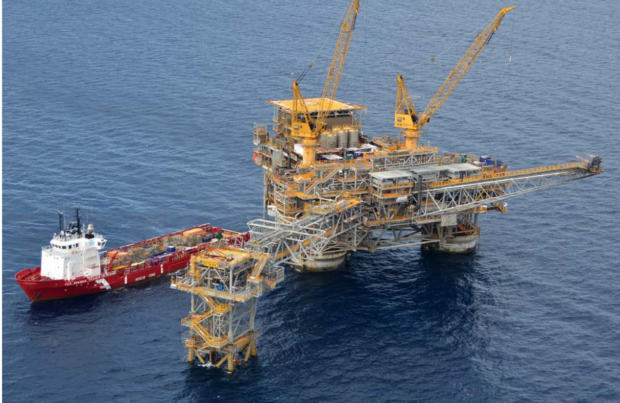
Figure 2 West Tuna (WTN) platform and RAT (in the foreground) with supply vessel alongside

The WTN platform is a gravity based platform with a three legged concrete gravity structure (Figure 2). The main deck area is 27 m above mean sea level.