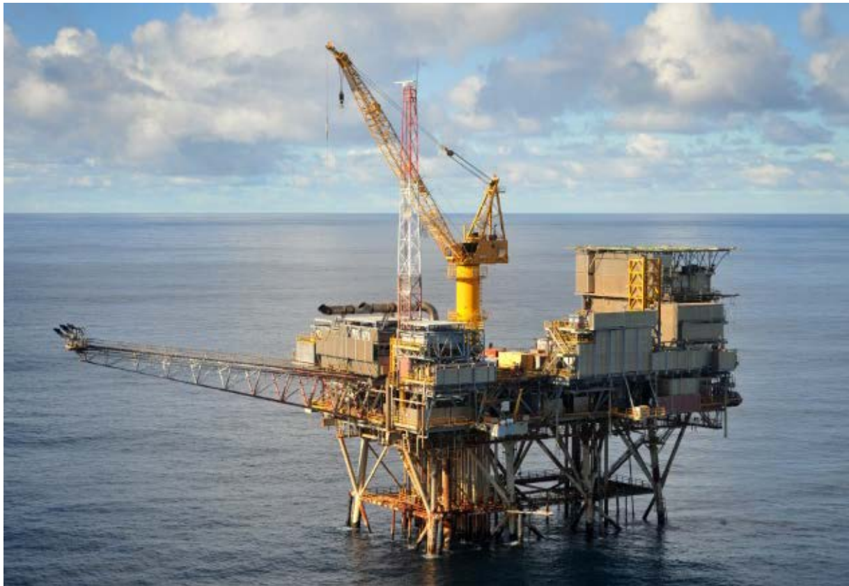
Figure 2 Flounder platform (FLA)

The FLA platform is a fixed installation consisting of an eight leg steel piled jacket (Figure 2).