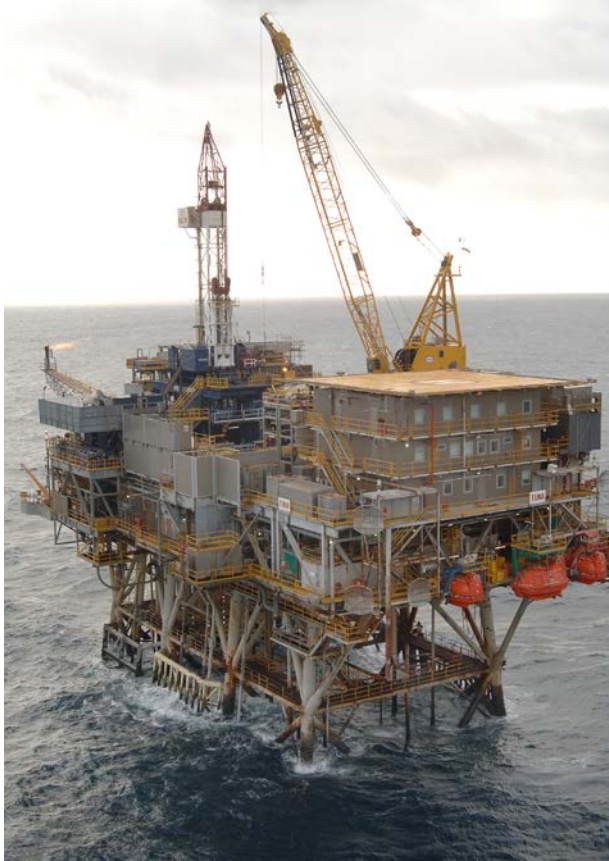
Figure 2 Tuna platform (TNA)

The TNA platform is a fixed installation consisting of an eight leg steel piled jacket (Figure 2).