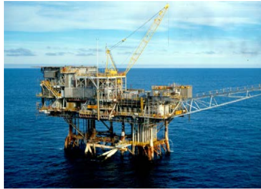
Figure 3 Kingfish B platform (KFB)