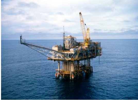
Figure 2 Kingfish A platform (KFA)

The KFA, KFB and WKF platforms are fixed installations consisting of an eight leg steel piled jacket structure (Figures 2, 3 and 4).