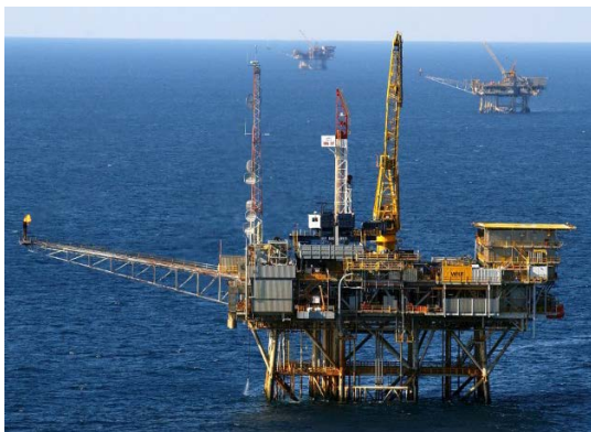
Figure 4 West Kingfish platform (WKF)

KFA and KFB oil production consists of a west and east production train. Oil wells are connected to either the east or west production header. From these headers, oil is directed to a production separator on east and west sides respectively. The west production separator operates as a two phase separator with water being directed to the water handling system. Oil and gas from the west production separator are directed to the east production separator via the east production header. The east production separator operates as a three phase separator with oil, water and gas outlets. The gas from the separator feeds into the gas compression system while the water outlet is directed to the water handling system. From KFA, oil is exported to KFB via the KFA-KFB400 oil pipeline. From KFB, the oil is exported to Halibut via the KFB-HLA500 oil pipeline.