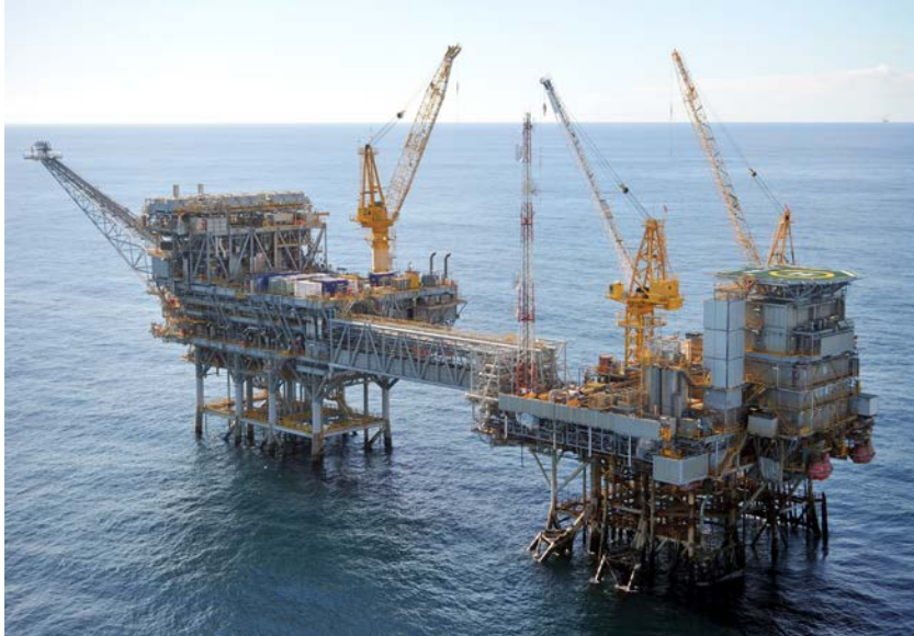
Figure 2 Marlin A platform (MLA) (right) and Marlin B platform (MLB) (left)

The MLA platform is a fixed installation consisting of two steel piled jacket structures (Figure 2). The MLB platform is a fixed installation consisting of an eight legged steel piled jacket structure (Figure 2).