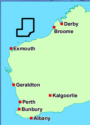
Survey Coordinates (GDA94z50)